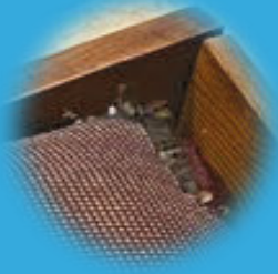
Repair of a few pews and staining all the pews in the church