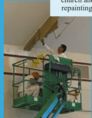
Repairing the leak in the church and repainting.