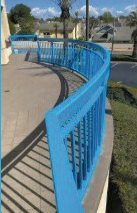
Painting all the railings