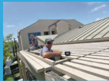
Most recently the roof and patio covering on the "L" building repaired after years of sun and all kinds of weather.