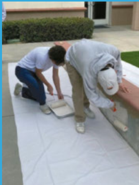
Two Eagle Scout projects—one repainting the border walls in front of the church; the turf placed in the planter area in front of the church was the second one.