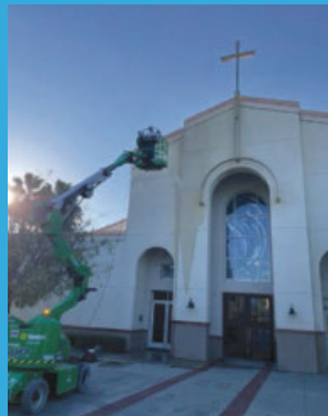
Power-washing the front of the church and dusting the bronze figure of Jesus