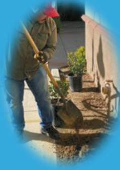
Replacing plants and powerwashing outside of the buildings on campus