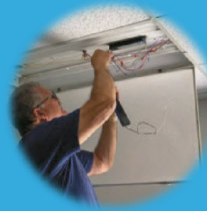
Replacing and repairing lights all over the campus